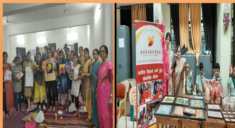
Department of Sociology organized Srujan Work shop and Akansha exhibition

Department of physics has organized a workshop on circuit design on 22-23 October, 2019